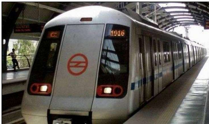
Train Cabin & Tanks Fabricate