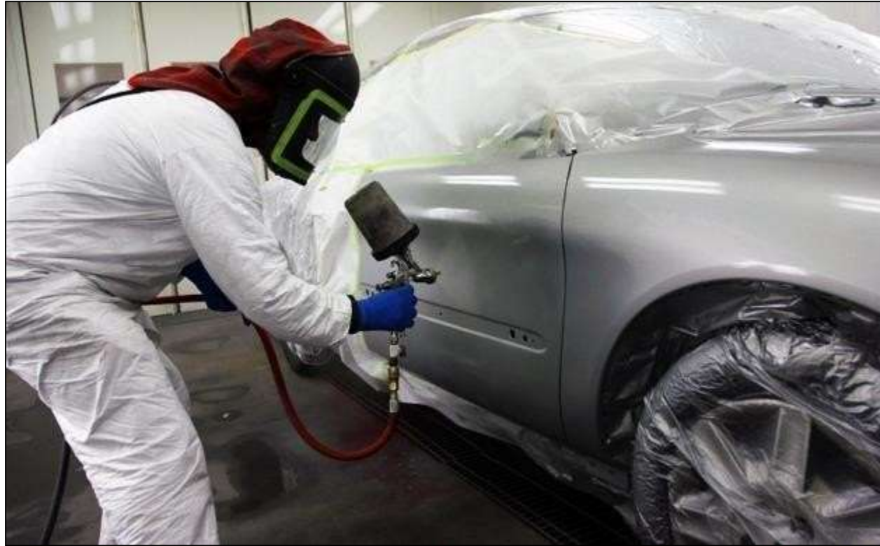
Paint Touch Up & Painting Work