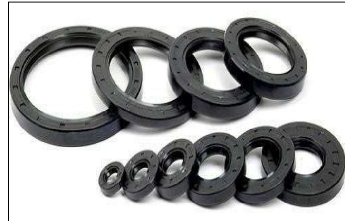
Oil Seal Manufacturing